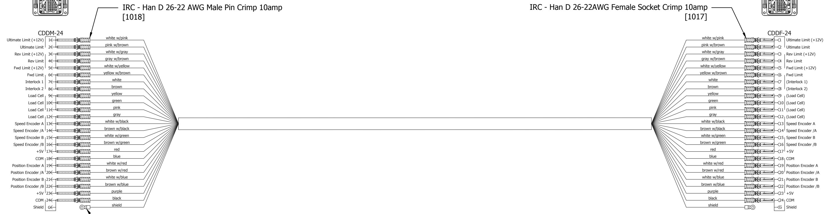
Crimp - Ring 16-14AWG for #10 Screw [47]